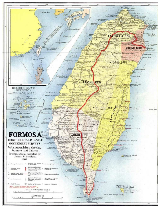
Figure 3: This 1901 map illustrates a red line demarcating the heritage of Qing control of people on the left side—leaving the other regions of Central and Eastern Taiwan to the self-ruling indigenous groups. Initially, the Imperial Japanese government of Taiwan from 1895 ruled up to line of control—then proceeded with military expeditions to conquer eastward. The map legend for the red line: Approximate boundary line separating Savage District and Territory under actual Japanese administration (James W. Davidson 1901.).

So now, what constitutes Taiwan and where does it belong? In terms of its geomorphology, it's an island riding on the East Asian continental shelf being uplifted by the Pacific tectonic plate. During the last Ice Age, it was the mountainous East Coast of Asia with the Taiwan Strait a forested and grassy plain.