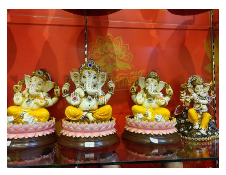
Figure 2: The three Ganesa on the lotus flower are imported from India and the Ganesa icon on the far right with coins under his throne is locally manufactured (January 2016).

We prefer to see images made by a Thai sculptor<sup>25</sup> because we want to promote Thai craft skills. Like this one (as in the following picture) is imported from India, they will use the colour red and yellow. However, it differs from Thai style. Our style emphasises on arts. Under the throne and the base, we fill in the coins which have gone through the ritual blessings as well. All statues have gone through the rituals. We invited Brahmins from the Wat Khaek Sao Ching Cha (Hindu Samaj) for the ritual and the Brahmin originally comes from Kusinara city. He has lived in Thailand for 15 years now.