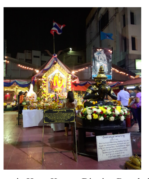
Figure 4: Famous Ganesa shrine and devotees in Huey Kwang District, Bangkok.