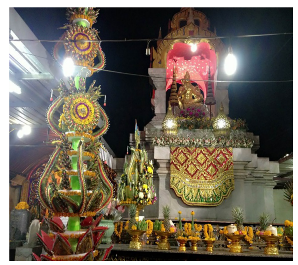
Figure 1: The image on the left is the Siva shrine after renovation into Heramba Ganesa. The image on the right is the original Siva shrine commissioned in 1990.