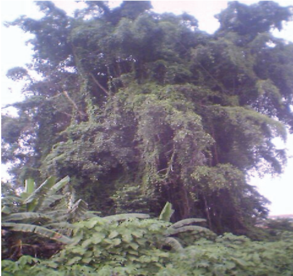
Plate 3. A mythical nunuk ragang – Tambunan Dusun's "Tree of Life"