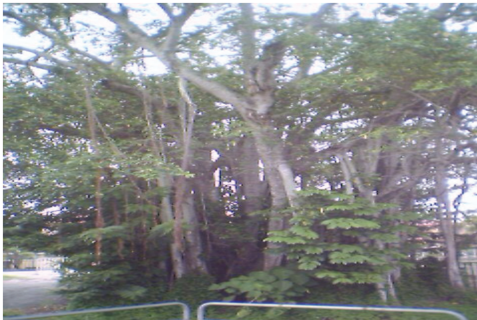
Plate 2. A typical banyan tree ( nununuk ragang ) commonly found in Sabah